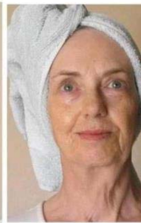
After 2 Weeks Using Timewise Repair

1/2 drawer full of products script goes in with this page (pic page faces guests)