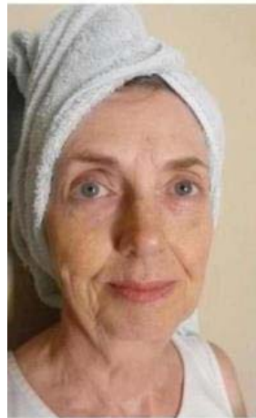
Before TimeWise Repair